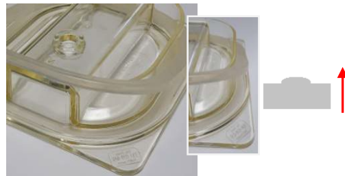
Seal assembly GreenVAC GN 1/6