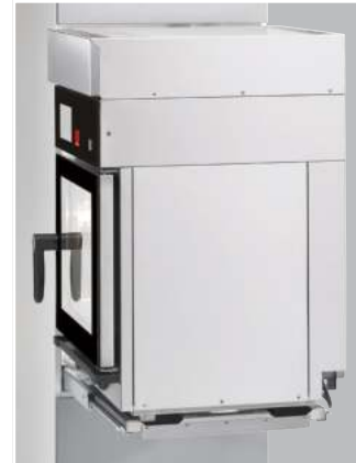
Perfect for servicing