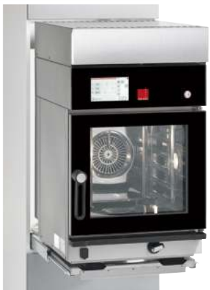
Safe to pull out

So simple, so individual, so perfect! Their unrivalled pull-out and rotate function makes this integrated design particularly easy to service. 90° rotation gives service engineers easy access to the interior of the Salvis CucinaEVO. So maintenance is quick and easy