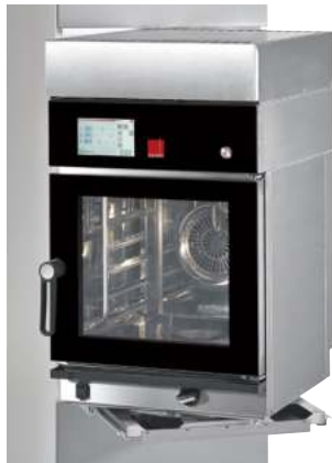
Easy to rotate